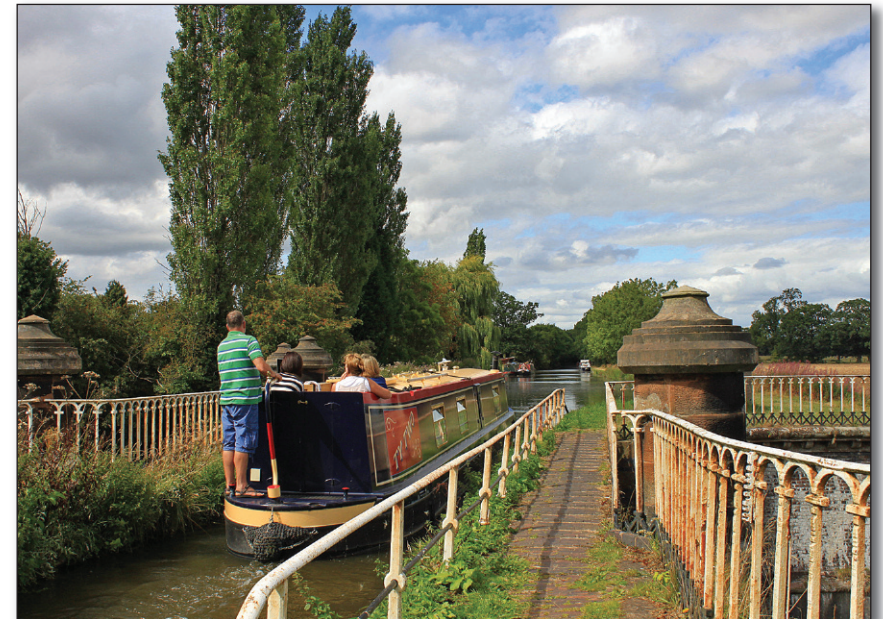
Below: Example of a double-page spread.